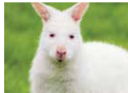
GENETICS AND EVOLUTION