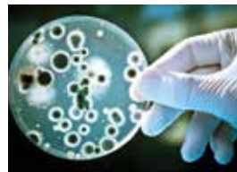
THE NATURE OF SCIENCE